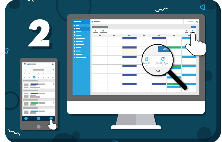
Click "Set Up Sync" in the toolbar