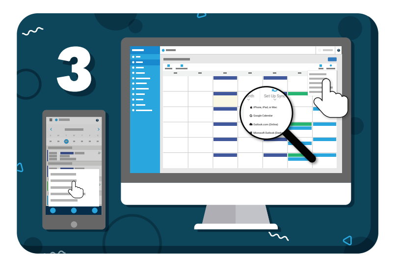
Select your device type from the drop-down menu

Follow the on-screen instructions to complete the sync